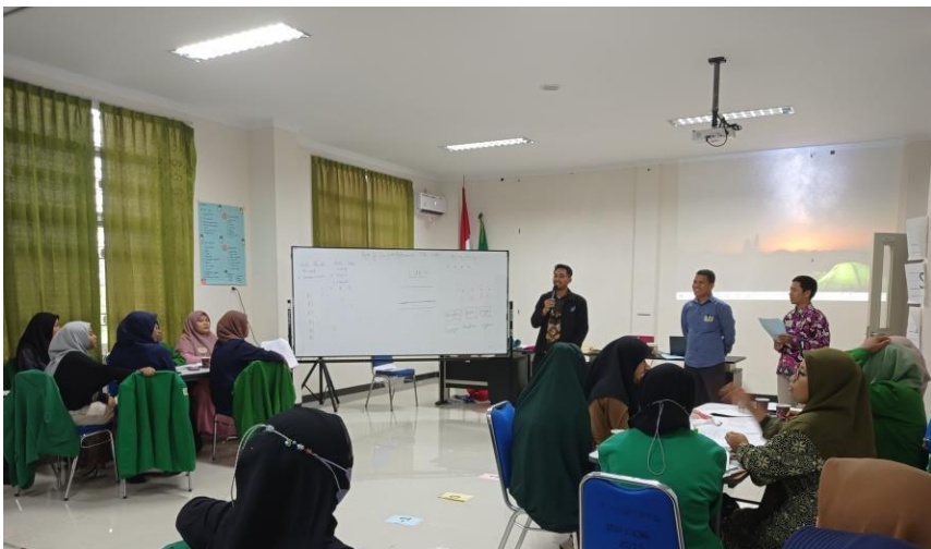
Image 4: Training also includes the form of inclusive learning and positive discipline

part of moral education. Character education is a crucial aspect that needs to be integrated into learning. One of the character values considered important in supporting learning activities is responsibility. If students lack responsibility, issues such as deviant behavior may arise, for example, needing to perform tasks only when instructed by others[19]. Character-based learning is an educational approach aimed at fostering the development of moral and ethical values in students [20]. Character is a combination of habits and character[21]. Teaching students to understand the negative impacts of bad behavior and giving them the tools to change that behavior is an important step in character building. This process involves self-reflection and understanding the consequences of their actions, which in turn helps students develop self-control and responsibility for their actions. Thus, effective moral education not only emphasizes the development of virtue, but also the ability to overcome and avoid vice, thereby producing individuals with good character and morals.