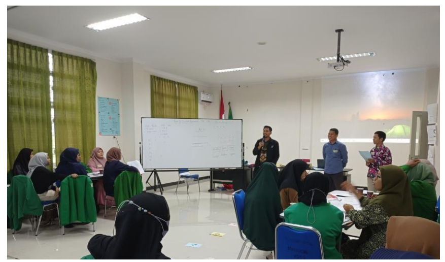
Image 4: Training also includes the form of inclusive learning and positive discipline

part of moral education. Character education is a crucial aspect that needs to be integrated into learning. One of the character values considered important in supporting learning activities is responsibility. If students lack responsibility, issues such as deviant behavior may arise, for example, needing to perform tasks only when instructed by others[19]. Character-based learning is an educational approach aimed at fostering the development of moral and ethical values in students [20]. Character is a combination of habits and character[21]. Teaching students to understand the negative impacts of bad behavior and giving them the tools to change that behavior is an important step in character building. This process involves self-reflection and understanding the consequences of their actions, which in turn helps students develop self-control and responsibility for their actions. Thus, effective moral education not only emphasizes the development of virtue, but also the ability to overcome and avoid vice, thereby producing individuals with good character and morals.